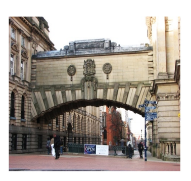
Fig. 4: Pedestrian way, in the context of the central and commercial center of Birmingham city, which is a shortcut way for accessing the central tissue.