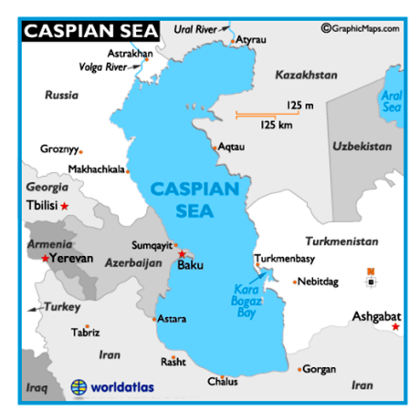
Fig. 1: Location of Caspian Sea

It is not clear till date how many seals survive in the Caspian Sea. Of one million seals during twentieth century, only 1,10,000 to 3,50,000 seals are predicted to inhabit the region now-adays (Figure 3).