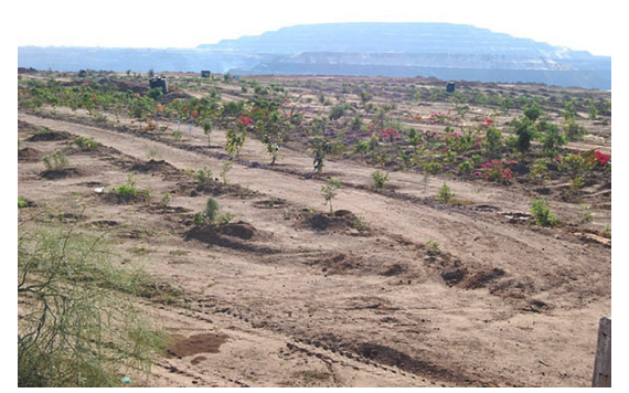
Fig. 4: Tree Plantation on Back-filled Region at Mata No Madh Lignite Mines