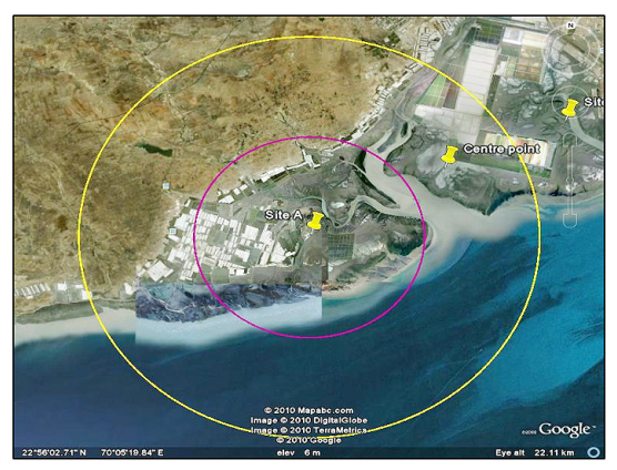
Fig. 2: Site A (MSEZ - I)

This step is typically connected to remediate the unavoidable remaining antagonistic effects.