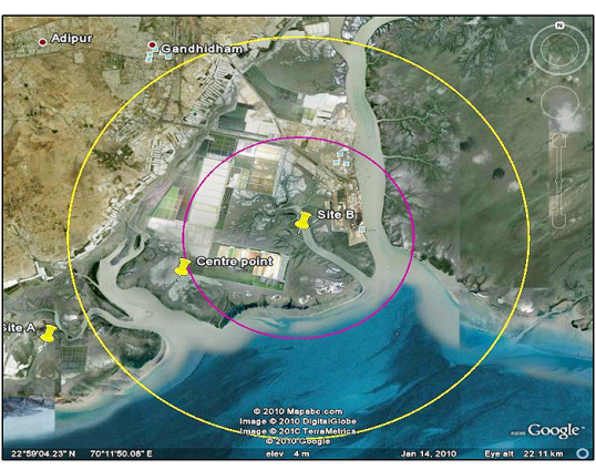
Fig. 3: Site B (MSEZ - II)

The port of Kandla, presently known as Deendayal Port Trust (DPT), established in 1931, owes its source to the leader of the then august province of Kutch, Maharao Khengarji III. He needed an all-climate shut port for his kingdom and fabricated a RCC breakwater where boats of about 8.8 meters draft could billet round the year. This pier, which is situated at old Kandla, turned into the core of what in present years was to develop as the Deendayal Port. On January 20, 1952, Pandit Jawaharlal Nehru, the then Prime Minister of India, established the framework stone for the new Port on the Western Coast of India. It was proclaimed a Major Port on April 8, 1955 by Late Shri Lal Bahadur Shashtri,