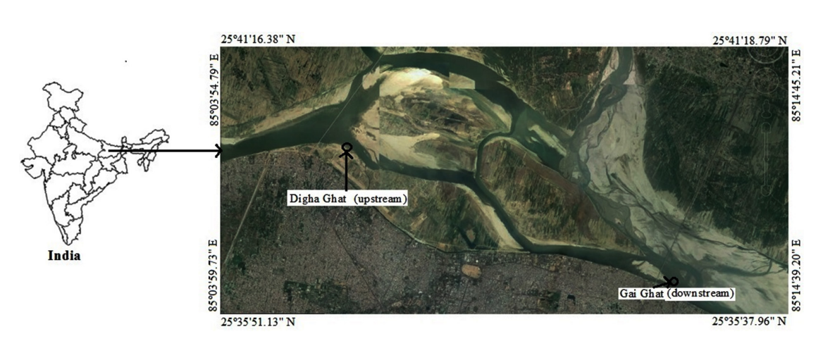
Fig.1: Location map of sampling sites beside the right bank of river Ganga at Patna. The study sites are: Digha Ghat (upstream) and Gai Ghat (downstream).

The altitude of the study area ranges from 44.2 to 50.3 meters asl. Patna district had the total population 5,838,465 and population density 1,823 people per km<sup>2</sup> recorded.<sup>5</sup> Patna town is the capital of Bihar and situated lying on the south bank of the river Ganga. A feature of the geography of Patna is its convergence of rivers of Ganga and Gandak at downstream. Uniqueness of Patna is having four