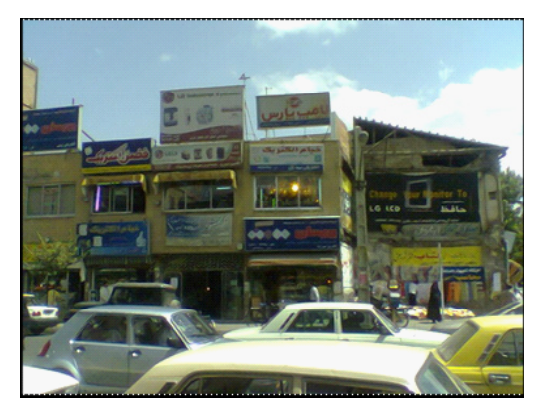
Fig. 5: Visual disturbance