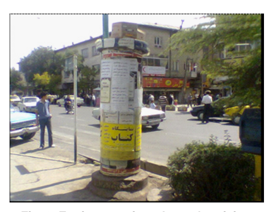
Fig. 3: Equipments for urban advertising

In Urmia the beautification organization is the responsible of supervision on the advertising of urban advertising. This organization prepared some programs for improving the condition of urban advertising. For this, there are new laws passed that according them all organizations and instructors and people should have permitted for their advertising signs. Also the installation of advertising billboard is done by supervision and place fixation by this organization and advertising clubs. Until 1384 traffic