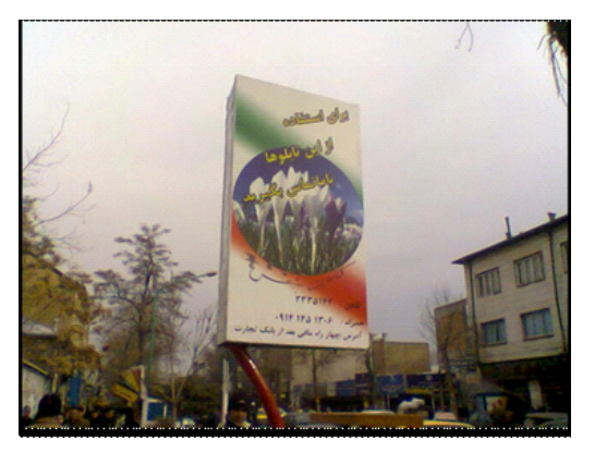
Fig. 4: Equipments for urban advertising

in this space. And in the middle of the day is in the low mobility. Because of services that are offered in the streets of every class and group pf people in this space and every of them wants varied needs and wants. From elements of urban landscape in Imam St. can point to entrance of main markets, great mosque and Sardar mosque and also administrative buildings as educational system and transmission.