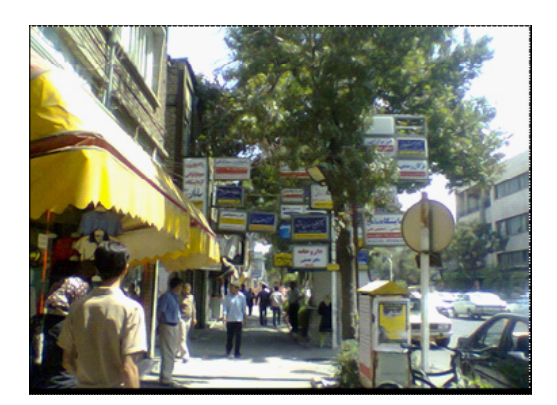
Fig. 2: Medical signs

Urmia is located in a wide plain and near the Urmia Lake in the west of Iran and is the center province. Urmia had more of half million people. Corpus in this study is Imam St. between Inghilab Sq. (lialat) and Velayat-e-fagih (center). The path studied is a main part of old Urmia. This path that connect the army house to the main and old market, is the first modern street that was built in the first Pahlavi era. This street divided market of city into east and west parts. Imam St. Of Urmia after the market lost its original function, known as the city's business center. Also this street has the city's most important role of access between multiple locations. Because commercial activity that is dominant in the streets, nearly fifteen hours a day of activity seen in this axis. 10 to 1 a.m. and 5 to 9 p.m. are the most active hours