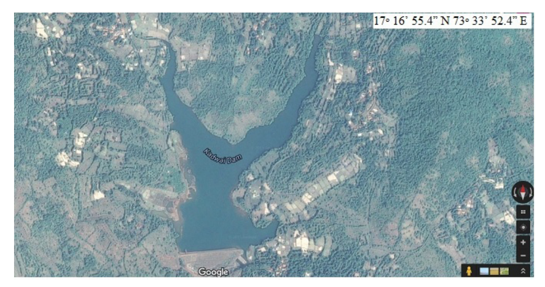
Fig. 1: Satellite location of Kadwai reservoir, Sangmeshwar, Ratnagiri, Maharashtra

activities of microbial organism due to the deposition of organic matter into the reservoir and therefore, fortnightly variations were observed during study due to these effects in primary productivity of Kadwai reservoir. Patil et al. in Ajara reservoir, noticed that the seasonal changes in primary productivity were minimum ranges during the monsoon and maximum in summer season<sup>5</sup>. The primary productivity data were collected during monsoon and post monsoon season. Koli et al. observed that gross primary productivity (GPP) values ranged between 1.93 and 6.24 gC/m³/day, net primary productivity (NPP) ranged between 0.72and 499 gC/m³/day and community respiration (CR) ranged from 0.26 to 3.6