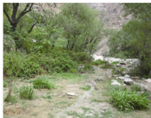
Fig. 36-4: North sight of resting situation