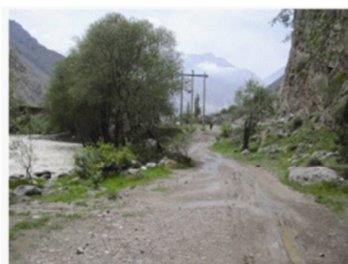
Fig. 27-4: south sight, in front of Haraz road, main entrance of side