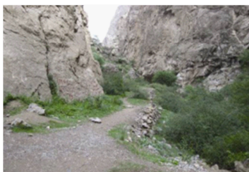
Fig. 34-4: Animal-riding road toward ancient work

Being country the considered region, cleanliness of water and being far from acoustic and environmental pollution are factors result in refer people and passengers there at various seasons of year, particularly spring and summer in order to rest and spend leisure time, and this condition, also is another manifestation to attract tourist in considered tourism center.