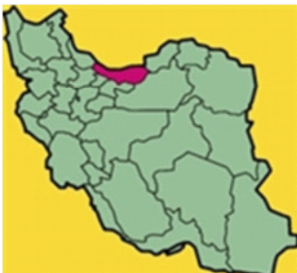
Fig. 7: Part of site