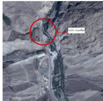
Fig. 4: Considered region