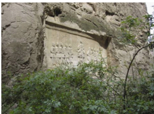
Fig. 26-4: the west-North side of shekel shah

Rural district of "lower Larijan" (sofla) includes: Panjab, Delarestagh and Namarestagh and 17 villages that are known as "17 block", and is divided into parts of northern and southern section.