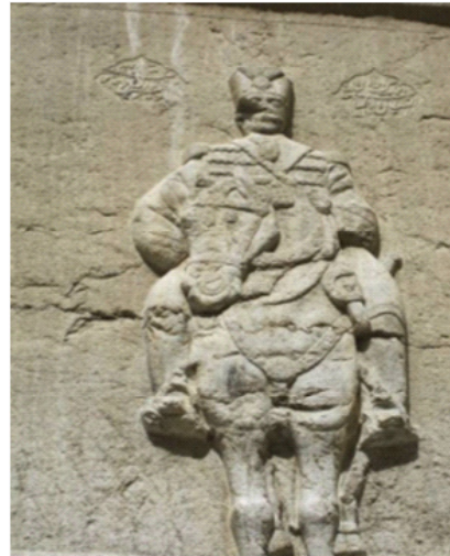
Fig. 018-4: shekel-shah