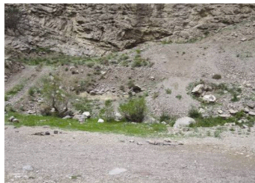
Fig. 25-4: West-North sight