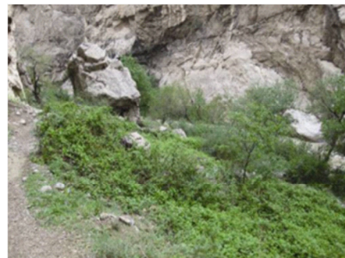
Fig. 33-4: East-North sight from slope of animal-riding way