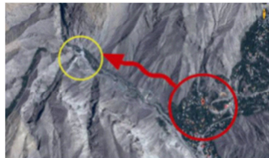
Fig. 20-4: situation of Vana to site