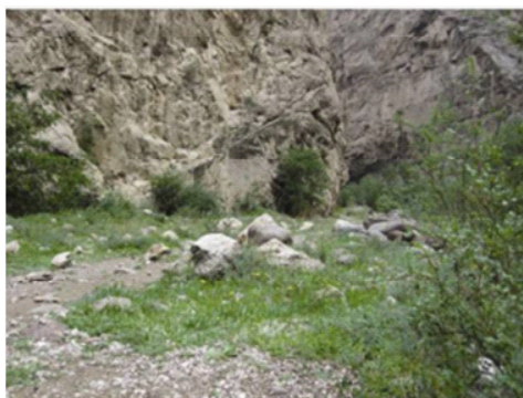
Fig. 32-4: Animal-riding route toward strait