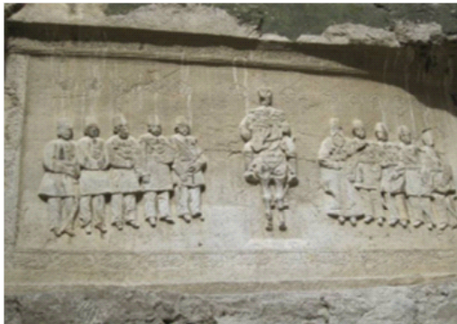
Fig. 9 :Embossed Figure available on site

Totally, just three theories are extracted of total subjects about Amol appearance: A) Before Aryans tribe's migration to Iran plateau and residing there, a tribe had resided in northern region of Alborz mountain chains and southern margin of Caspian Sea who was known as Amards.