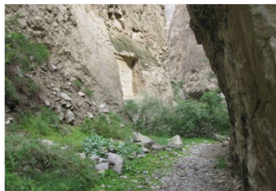
Fig. 8: Embossed Figure available on site