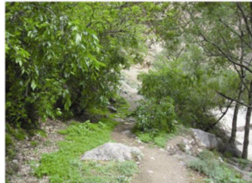
Fig. 31-4: the entrance of animal-riding route toward shekel shah (the first strait)