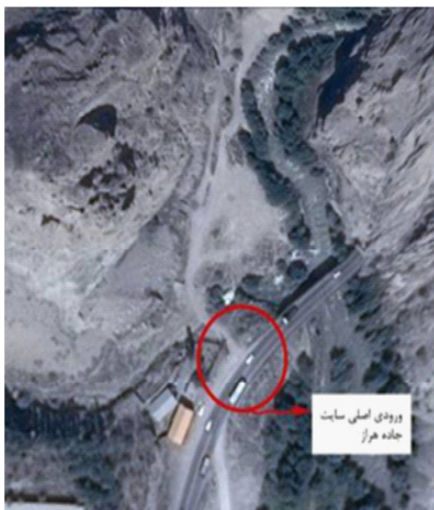
Fig. 19-4: main entrance of site