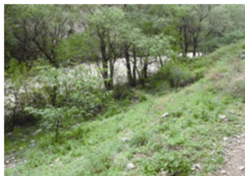
Fig. 29-4: East-south sight, adjacent to river