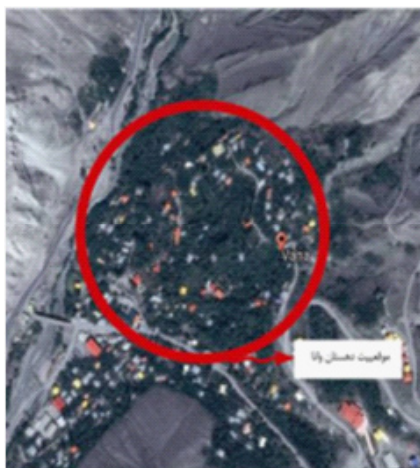
Fig. 2: Situation of Vana rural district