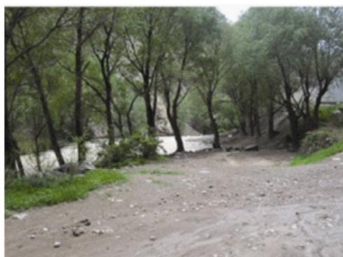
Fig. 28-4: East-south sight, adjacent to river