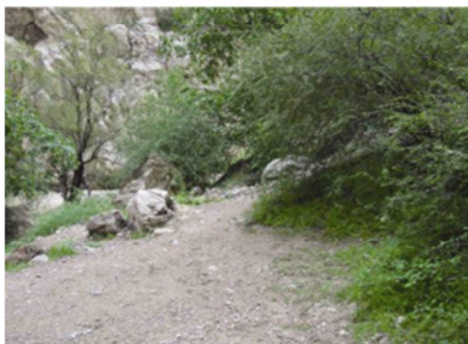
Fig. 35-4: the resting place at right side of shekel-shah work (due to nature intactness and preserve environment, this region is Lack of any design and project, the minimum capacity for visitors as standing posture is 200.