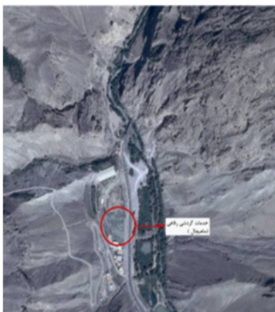
Fig. 23-4: Tourism services, welfare Mahychal