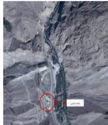
Fig. 22-4: situation of gasoline station