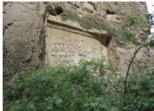
Fig. 6: Epigraph of “Shah Shape” in the site-3-1) Historical works