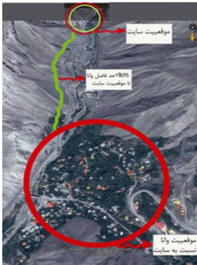
Fig. 5: Vana situation than site

At Royan history, it is narrated that: there was a Tabari poet in Royan who was known as Royanian pole, he compsed a stophe-poem into tabari language; and where he remembered the Bahar speech and description of Royans hunting-