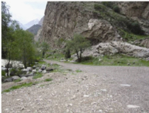
Fig. 30-4: west-south sight

Approximately, there are abundant springs and rivers in all sites of Larijan. At mountainous regions, it is full of water in winter and early of spring and is low-water and sometimes dries. Other water resources of region are small local Lakes that create when rivers overflow at parts that level of underground water is high, and they are used to agriculture, hunting and fishing.