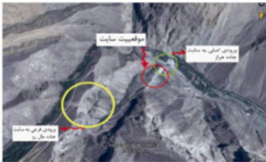
Fig. 21-4: Introducing site entrances