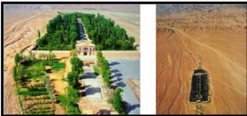
Fig. 2: Prince Mahan garden

The effect of concentration on feeling of enclosed garden: in Persian garden, man moves in the main axis of garden, not very often can see the surrounding walls. it is not cause of distance but cause of the axis motion are visual axis not corridors[16].The voice of water, birds creates