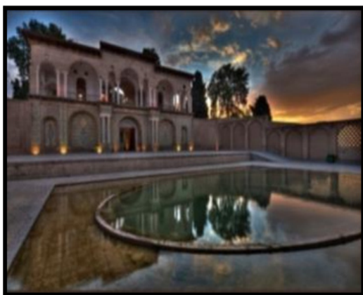
Fig. 4: Parsin of prince Mahan garden, Source:[7]

Closed space: define as a specified range that separated the borders.[27] in ancient Persian language the word Paradise means as a fence that later replaced with the word of garden.[26] Heidegger, states garden walls as a border that separated outside and inside of garden and also connect them together.[12] when people faces the garden walls, they will ask themselves will be another world behind the walls?