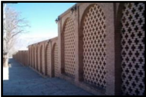
Fig. 1: Fakhr-i-Madin

The relation between man, nature, garden location :Iranian from past like to create yard and garden. they created gardens in building surrounded and called Paradise [5].Schultz describe gardens as a cultural outlook that ram natural forces and emerges as an organized system. the human image of heaven is enclosed garden. in cultural outlook, human create the garden, organize it and give the garden parables of Heaven.[29] the condition to reach the place spirit is to create garden on a desert nature that it likes Prince Mahan garden.Figure2.[27] in fact, the concept of man-made garden in Persian garden, reflects the spirit of place cause it creates a spatial structure of the garden that emphasizes on directions( four main direction), extension and abstraction of nature spirit of place.[4] perception the environment causes of the sense of place[25] in the Persian garden, so the garden creating infinite space that uses all human senses.[7] most of the researchers emphasizes that in Persian garden, the material is extremely spiritual upgrade and there were no ambiguity in relation between human and space.[18]