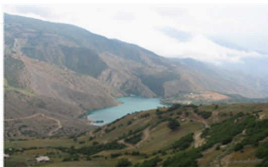
Fig. 3: Another view from the beautiful Velasht Lake