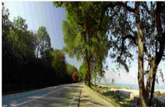
Fig. 1: Singan forest-coastal park in Noashahr

The link of the three factors of altitude (Alborz mountain), rainfall and sea has created the wet Caspian ecosystem. The growth of dense forest affected by these factors in the study area created a wonderful and charming beauty so that the forests of the study area are the main destination of domestic tourists. The most famous forests of Chalous are Sinava, Talajou, Zovat Sharghi, Mahmoud abad and Pole Karat. The names of these forests are included in the province notification resources.