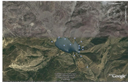
Fig. 2: Satellite image of the Velasht Lake and surrounding mountains