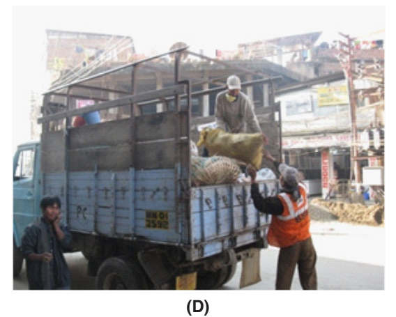
Fig. 2: (A) Storage of Household waste. (B), (C) & (D) Collection of waste from the Houses by NGOs in Imphal Municipality